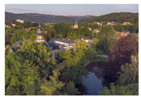
Mit diesem tollen Campus-Bild möchten wir mit euch den #Sommeranfang einläuten * #nofilterneeded #summer #summertime #studentlife #goodluck #campus #wernigerode #halberstadt #HSHarz #DiscoverHSHarz