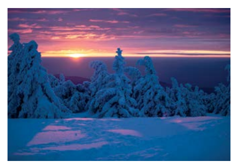
Sonnenaufgang auf dem Brocken 👟 🖰 #sunrise #winter #schnee #lieblingsort #beautiful #harzmountains #harz #HSHarz #DiscoverHSHarz