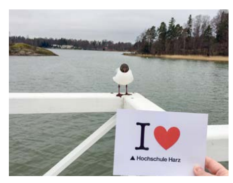
HS Harz Day 2018! ♥ Sogar Mio, die Möwe, feiert im 6 Grad kalten Helsinki mit ⓒ #ilovehsharz #HSHarz #campus #hochschuleharz #love #fun