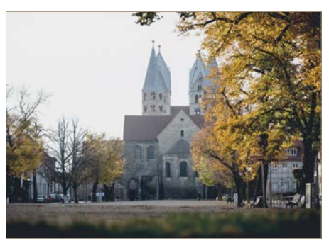
Herbst-Impressionen aus #Halberstadt ©! #hochdiehändewochenende #herbst #autumn #campus #hochschule #harz #HSHarz