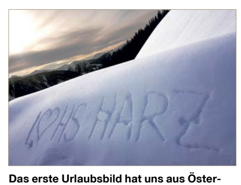
reich erreicht! * 🛝 #winter #schnee #hochschuleharz #ski #piste #urlaub #ilovehsharz