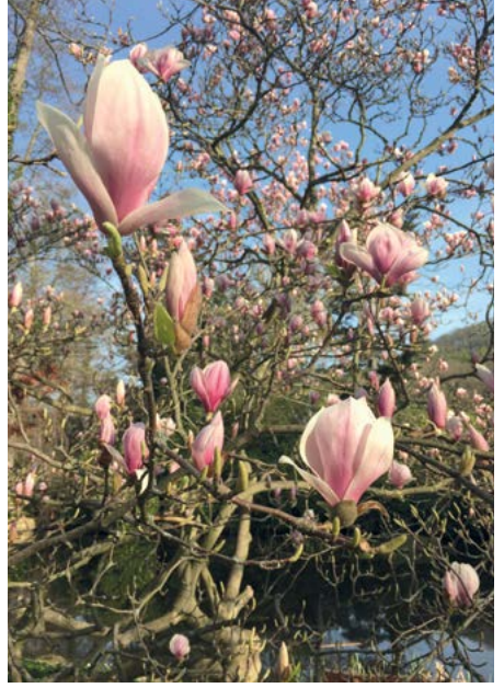
#Blütenpracht auf dem Campus & Genießt den tollen Sommertag! #HSHarz #campus #fridaymood #hochschuleharz #wernigerode #magnolie #tree #spring #summervibes