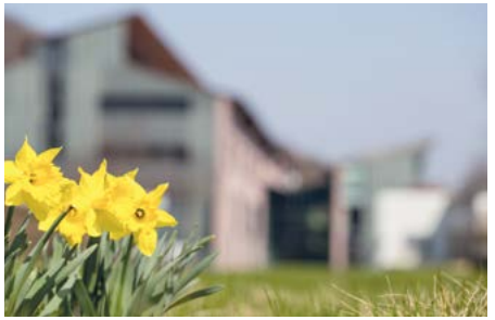
Hallo Frühling! ✿♥ #frühlingserwachen #spring #sommersemester #nofilterneeded #campus #hochschuleharz #HSHarz