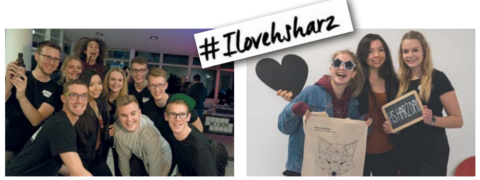
Pictures 1 - 3: The results of the photo activities were distributed on social media under the hashtags: #HSHarzDay and #Ilovehsharz.