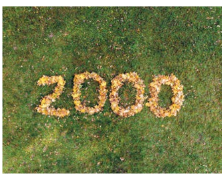
Wir sagen #DANKE für über #2000 #Follower #wirsagendanke #thankyou #hochschuleharz #wernigerode #halberstadt #HSHarz