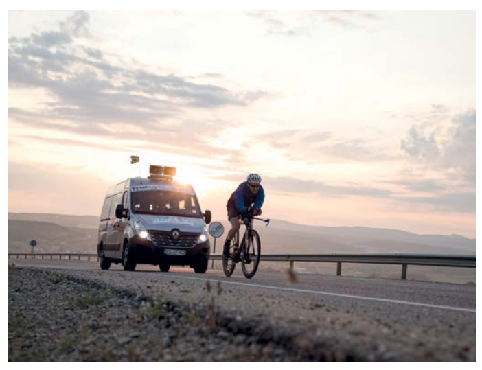
Picture 1: This photo was taken at sunrise, a cool 13 degrees and an average speed of 21.4km/h.