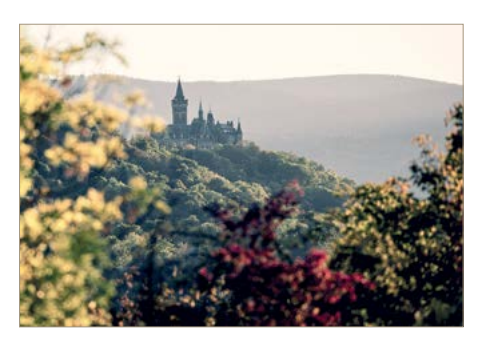
Herbstimpression vom Schloss #wernigerode #harz #HSHarz #hochschuleharz #brocken #braceyourselfautumniscoming #autumn #harzlife